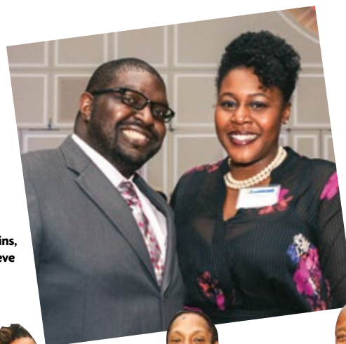
Our event always makes guests smile.