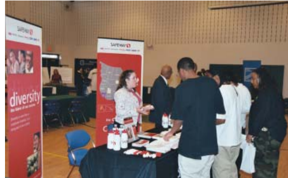
Students from the high schools learn about the employment opportunities available at Safeway.

Over ten years ago, The Foundation Schools implemented a comprehensive vocational education program to help prepare our students for success after graduation. This program, which has been modified and expanded over the past few years to better meet the needs of our students, received a new name this year that is more descriptive of its intent and goals in helping the students to make the connection between school and the workplace. The newly renamed Career Connections Program provides students with job readiness behavior training and skills, verbal and written communication skills, career interest exploration, application and interview skills, resume writing, daily life skills training, finance and budget training, technical skills in software usage and webpage design, work ethic development and independent living skills.