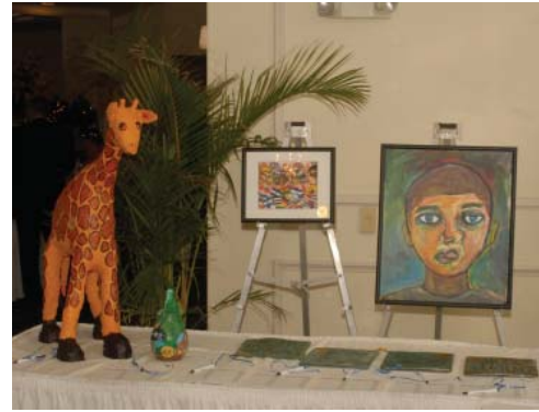
Unique student creations for auction.