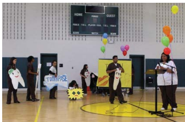
Dental students from Howard University put on a skit for the students.