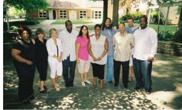
The Foundation Leadership Program Class of 2007.

The leadership program model was very well-received both within The Foundation Schools and within the greater special education and helping community. We have been honored to share our model for the program with other MANSEF schools as well as other local nonprofits. The second class of Foundation Schools' participants began their study in September 2007.