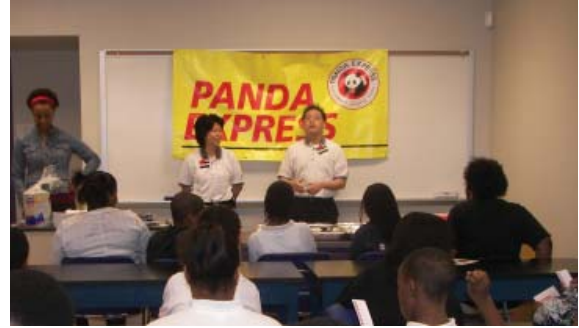
Managers from Panda Express give a presentation on Chinese culture.