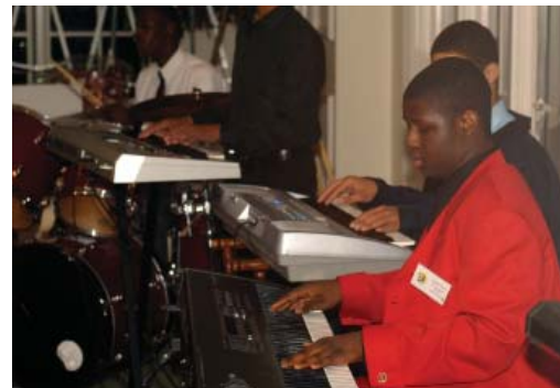
The Foundation High School Band.

The Foundation Schools extends a special thanks to our Sponsors: